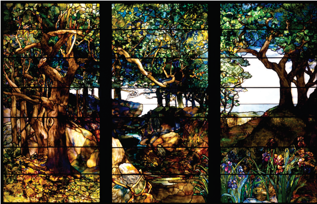
Louis Comfort Tiffany, A Wooded Landscape in Three Panels , c. 1905, glass, copper-foil, and lead, the MFAH, museum purchase with funds provided by the Brown Foundation Accessions Endowment Fund.

1. An ecosystem is represented in this stained glass window. An ecosystem consists of all organisms living in an area and the nonliving features of the environment. Use clues from this scene to infer what living organisms would be found here.