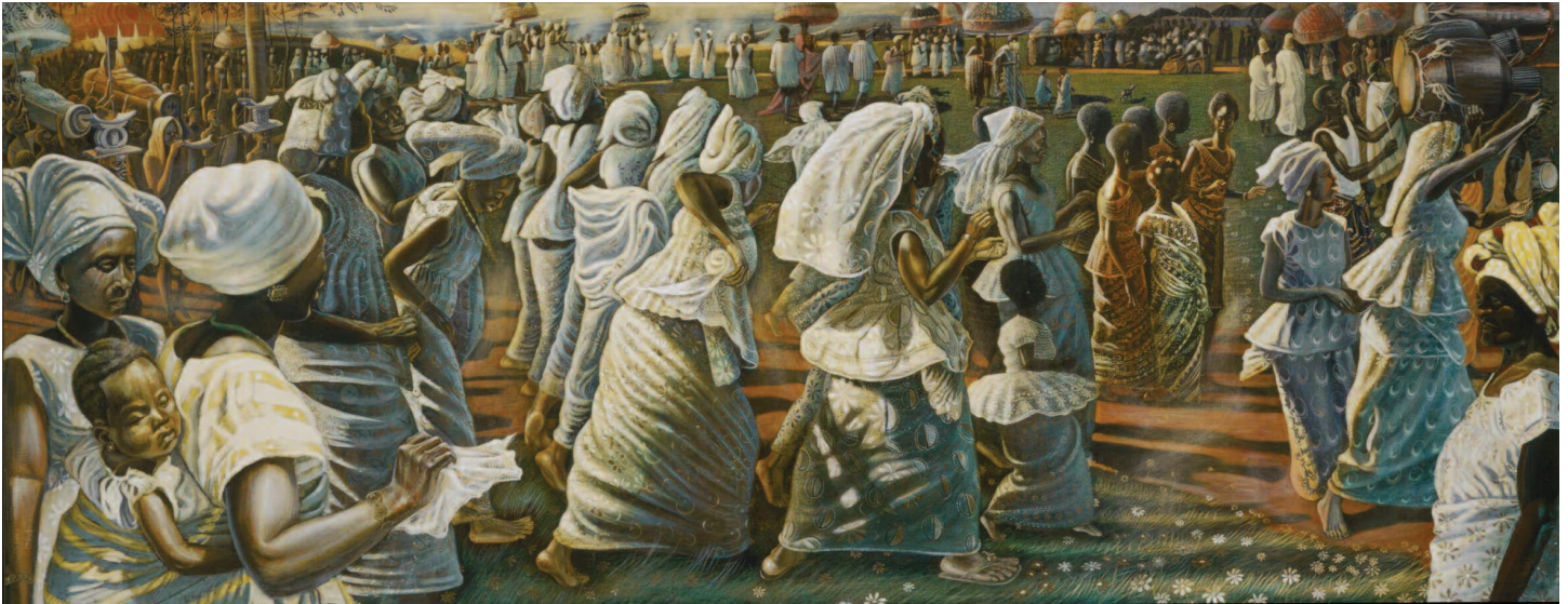
John Biggers, Jubilee: Ghana Harvest Festival , 1959–63, tempera and acrylic on canvas, the MFAH, gift of Duke Energy.

1. Imagine you have jumped into this painting in Ghana, Africa. Where would you see examples of different forms of energy? List those in the squares. Now return to your classroom and observe the forms of energy you see in the room; list these in the circles.